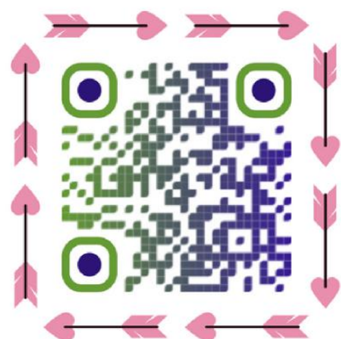
Badge Claim Form

Please email pinsandbadges@archerynz.co.nz or go to the online claim form by using the QR code below.